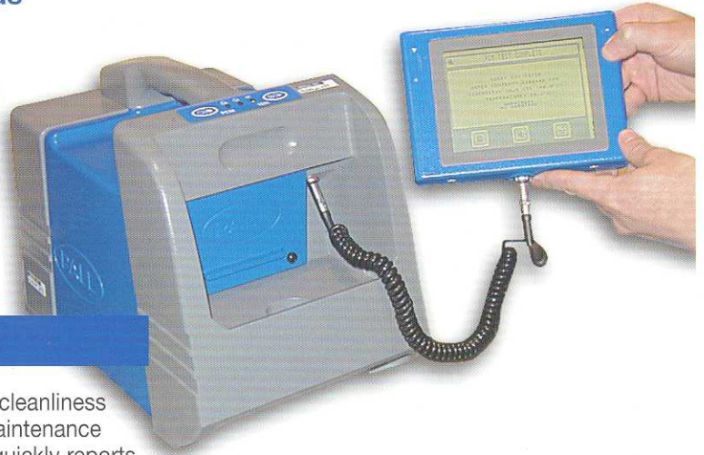
PCM400 Cleanliness Monitor

The Pall® PCM400 is specifically developed as a portable diagnostic monitoring device that provides an assessment of system fluid cleanliness.